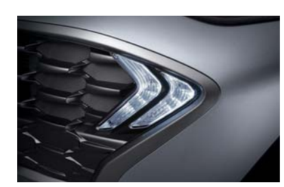
LED Daytime Running Lights (DRL)