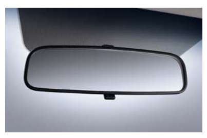
Day / Night rear view mirror